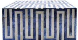
Mellie LG BL, Decorative Box worlds-away.com