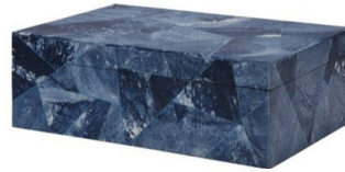
Kenmore, Decorative Box worlds-away.com