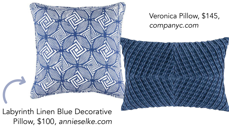
Labyrinth Linen Blue Decorative Pillow, $100, annieselke.com