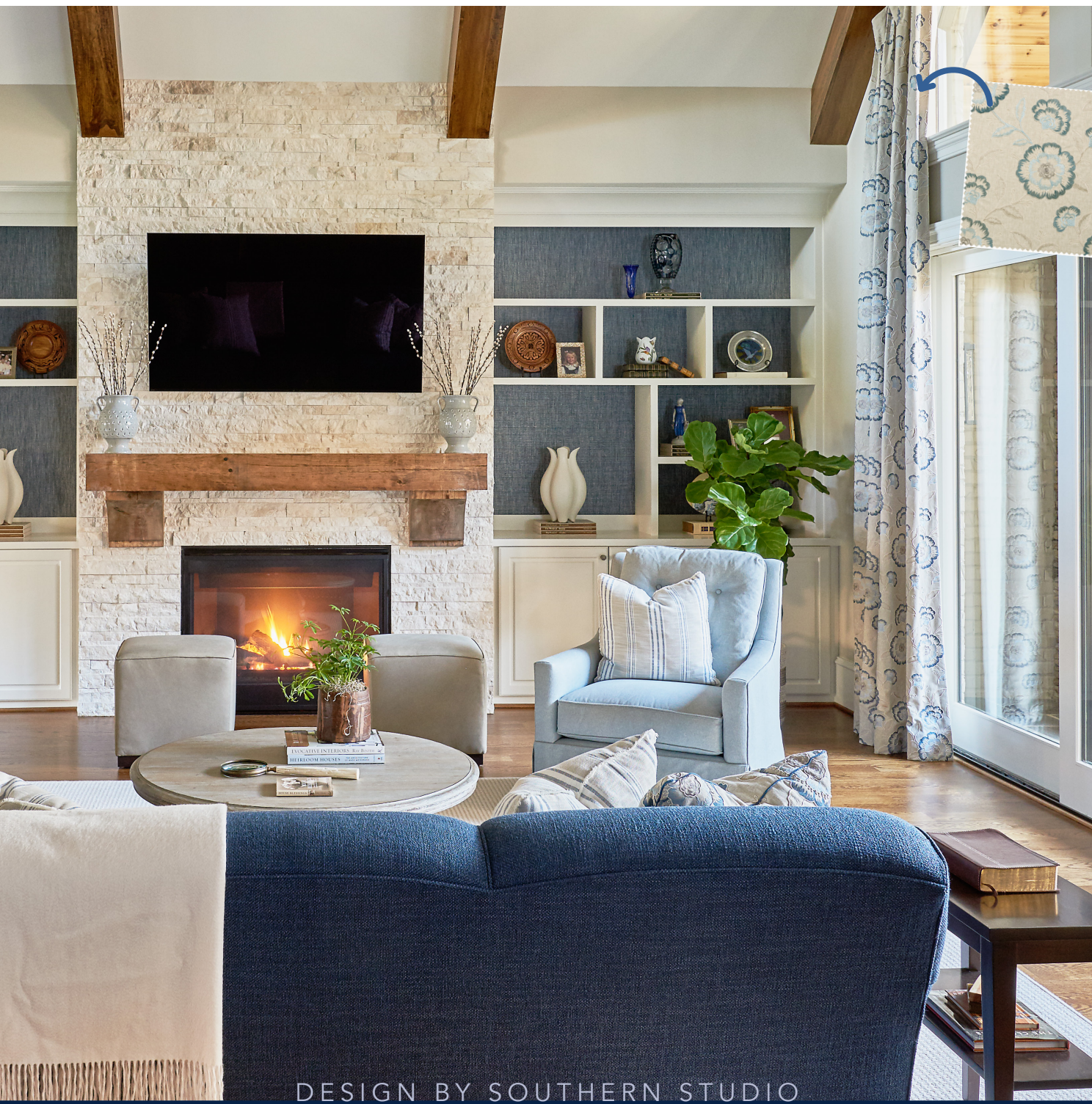
Window Treatment: Richmond in Denim, Clarke & Clarke, available at kravet.com