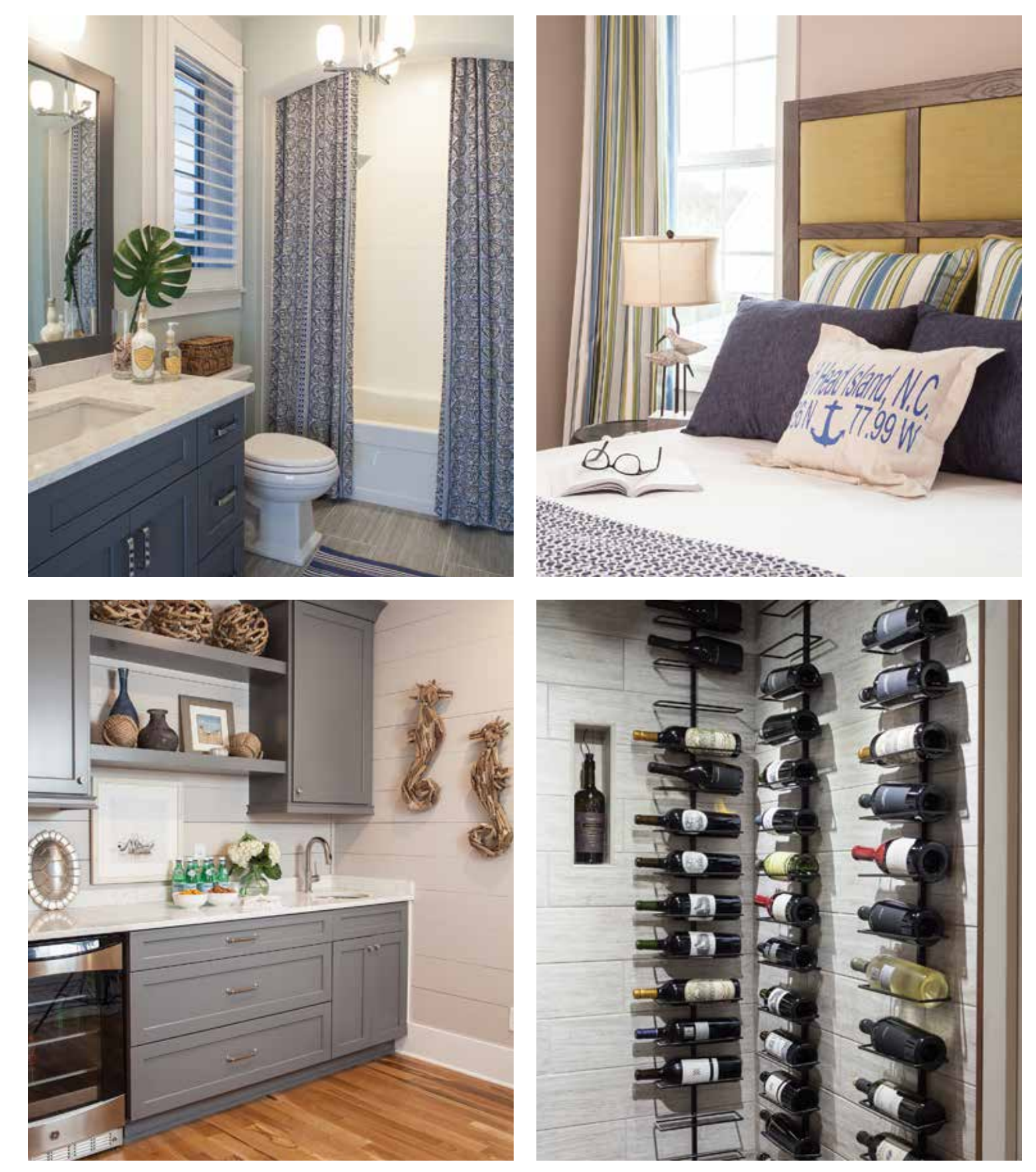
Left page: The shiplap in the living areas carries through to the master bedroom. Sea mist green accents create the serenity vacationers dream of. This page, clockwise from left: The arched shower alcove took this upstairs bathroom from ordinary to extraordinary; to each his own-all three boys have a private retreat upstairs; a temperature-controlled wine closet is an indulgent surprise cleverly hidden under the stairs; the landing upstairs provides a morning bar (and midnight snack central) for the boys.